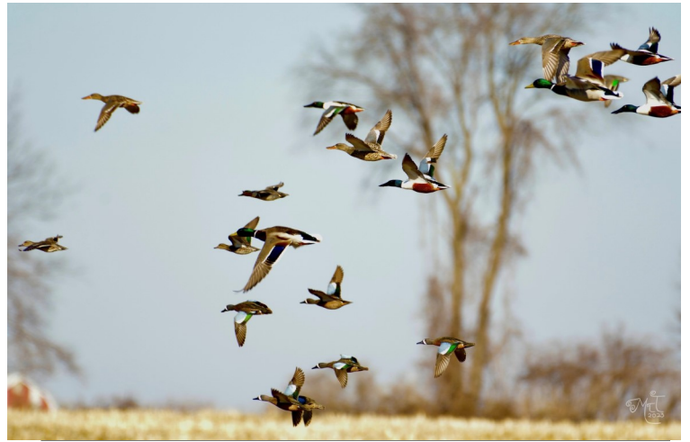
Blue-winged Teal and friends