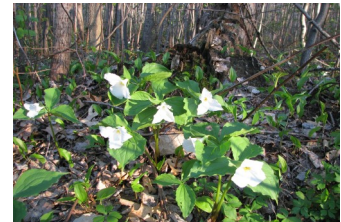
Trilliums in the Mead