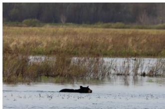
Black Bear Smokey Hill swim