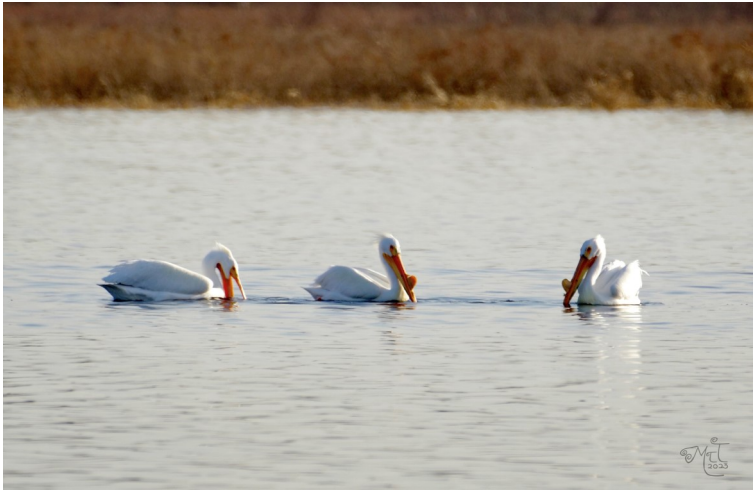
American White Pelicans