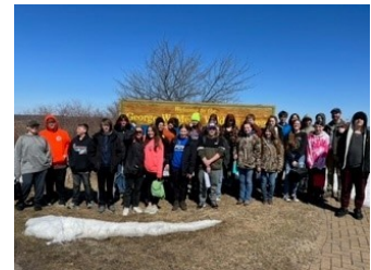
Point of Discovery school