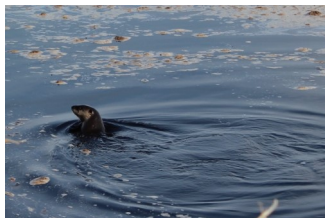
Berkhahn flowage otter