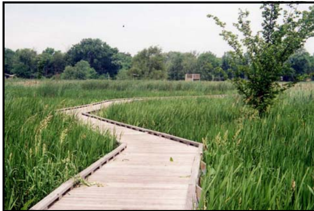
A prime example of our envisioned boardwalk.